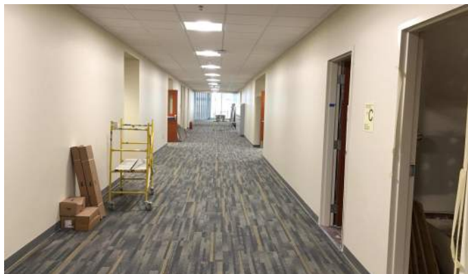
Area A 3rd Floor Finishes