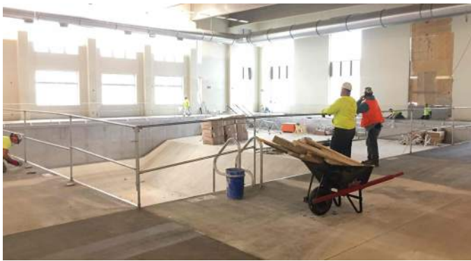
Area C Natatorium Concrete Pool Deck Placement