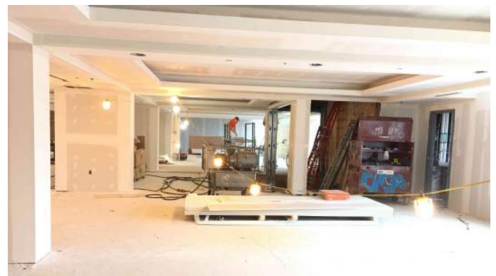
Area G Cedar Level Coffered Ceiling Finishing