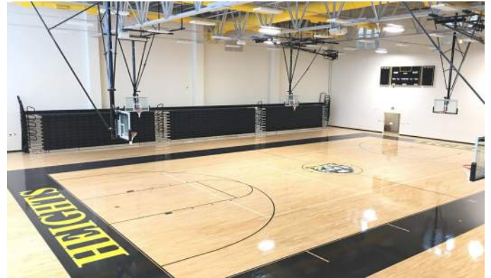
Area B Competition Gym Bleacher Installation