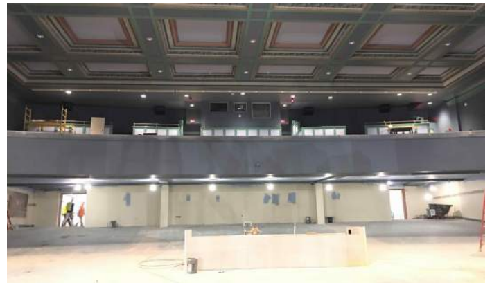
Area G Auditorium Painting