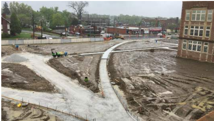
Area G Courtyard Sidewalk Placement